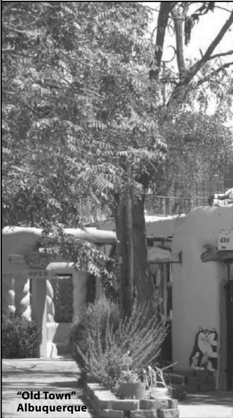
"Old Town" Albuquerque