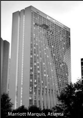
Marriott Marquis, Atlanta

October 27-28, 2008 • Marriott Marquis • Atlanta