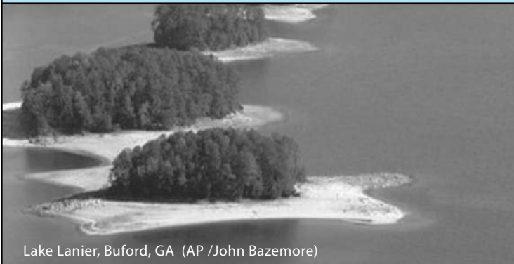
Lake Lanier, Buford, GA