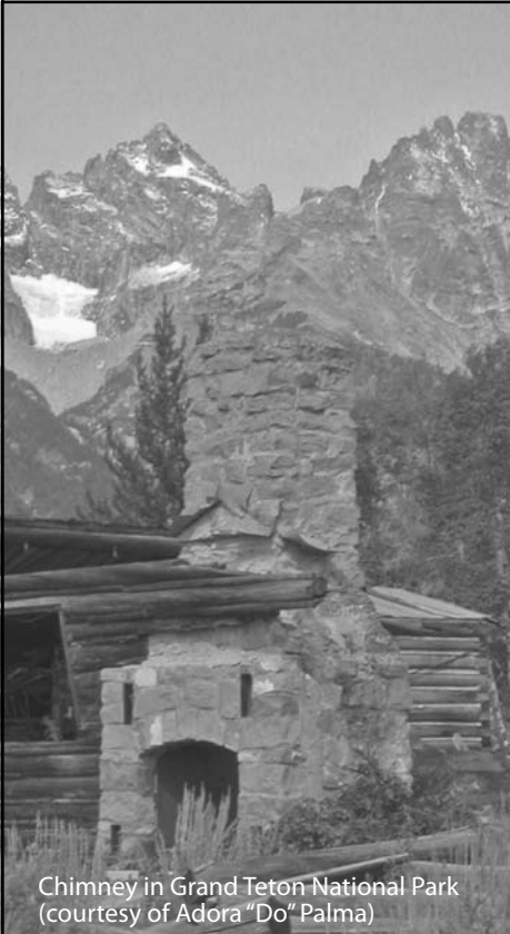
Chimney in Grand Teton National Park