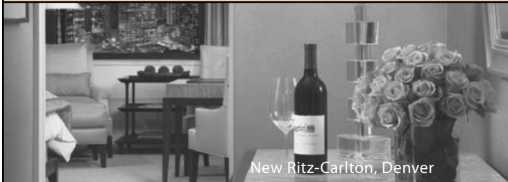
New Ritz-Carlton, Denver