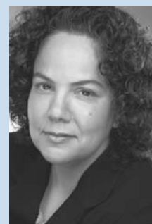
Nancy Sutley, Deputy Mayor for Energy and Environment City of Los Angeles

The City of Los Angeles— Efforts on the Local Level