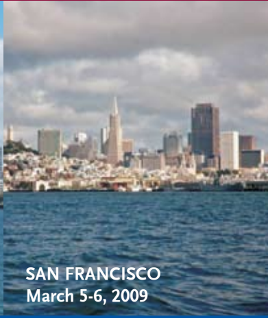
SAN FRANCISCO March 5-6, 2009