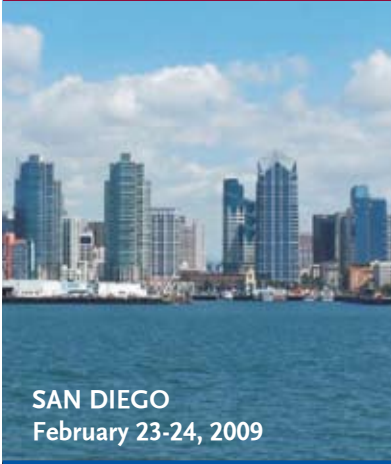
SAN DIEGO February 23-24, 2009

February 23-24, 2009 • Omni Hotel • San Diego | March 5-6, 2009 • Grand Hyatt • San Francisco