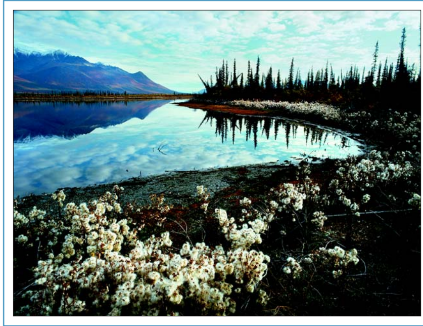
Subhankar Banerjee, Unnamed Lake , 2002, Ultrachrome Print, 30 x 40 inches

August 11-12, 2005 • Eldorado Hotel • Santa Fe