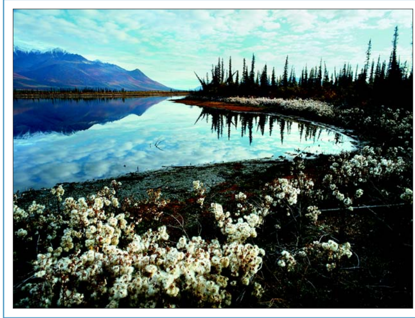
Subhankar Banerjee, Unnamed Lake , 2002, Ultrachrome Print, 30 x 40 inches

August 11-12, 2005 • Eldorado Hotel • Santa Fe