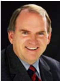
Gary K. King, Esq., Attorney General State of New Mexico, Santa Fe

REGISTER NOW! www.cle.com/nm or 800-873-7130